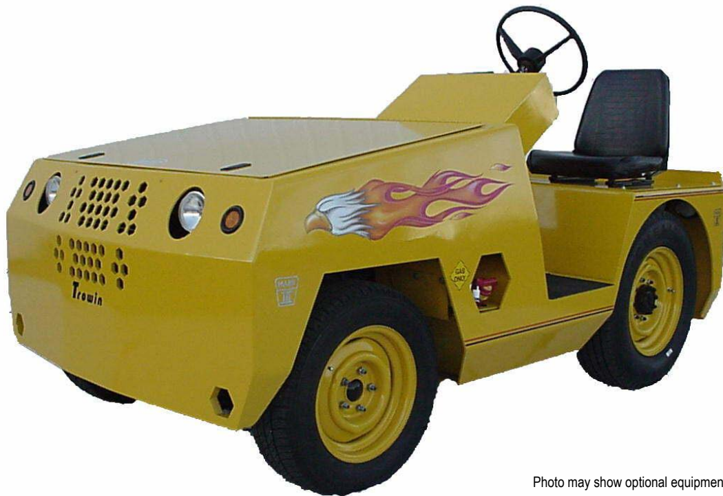
Photo may show optional equipment