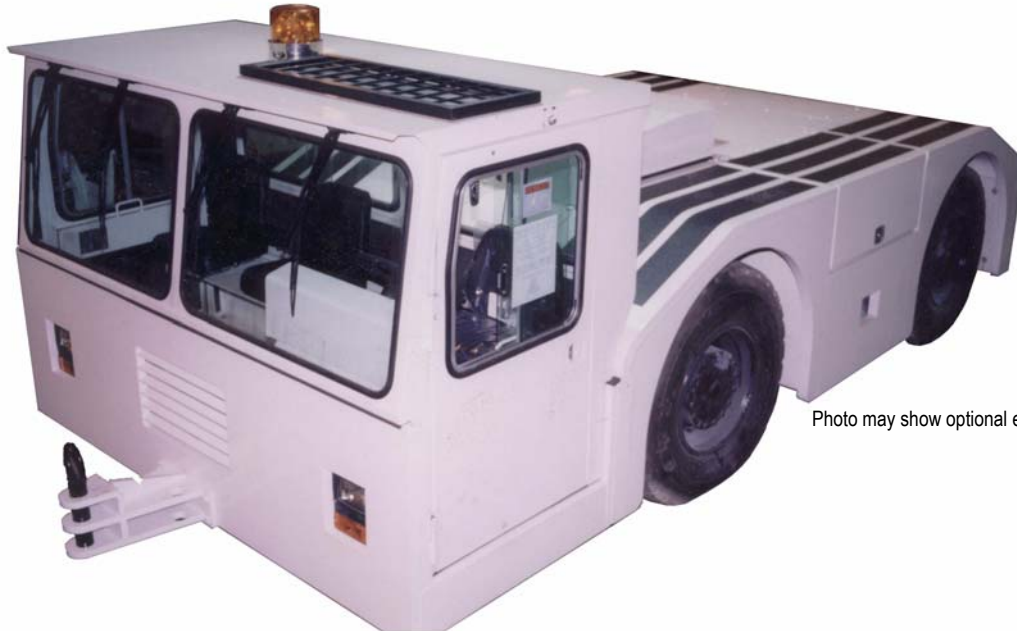
Photo may show optional equipment