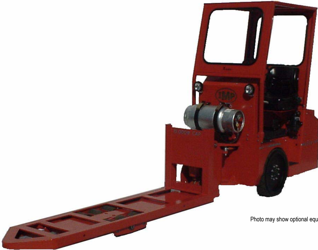
Photo may show optional equipment